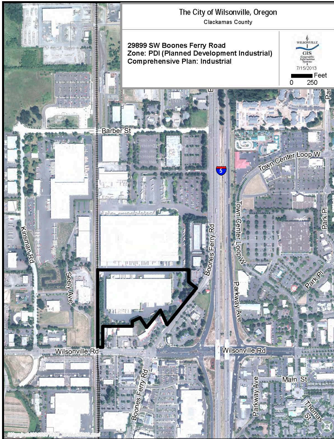
Figure 2 – Area Zoning and Comprehensive Plan Designations