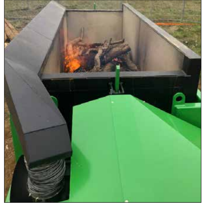
To avoid transporting MOB-infested tree debris, the Department of Agriculture brought an industrial incinerator to Wilsonville to burn infested wood.

Mediterranean Oak Borer is a serious and emerging threat to Oregon white oaks and other tree varieties. The pest is thought to thrive in trees already stressed by drought.