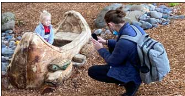
The nature play area at Memorial Park is among the recent City projects developed with funding from the Wilsonville-Metro Community Enhancement Program.

The City is looking for new community projects to receive funding through the Wilsonville-Metro Community Enhancement Program.