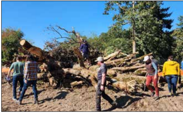
An infested tree in Frog Pond West was the first to be taken down because of decline as a result of Mediterranean Oak Borer, an emerging threat to Oregon oak trees.

City planners and consulting arborists have been collaborating with the ODA and the Oregon Department of Forestry since this summer, when suspicion of