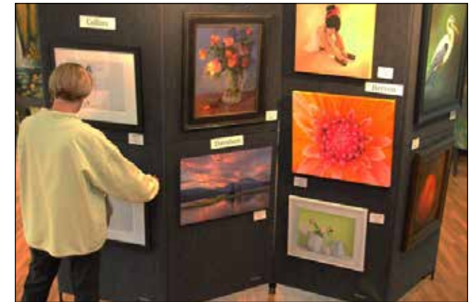
The Charbonneau Festival of Arts is one local program supported with Community Cultural Events and Program grant funding.

Please ... we're asking nicely ... take the extra moment to clean up your dog's mess. Let's work together to keep Wilsonville looking and smelling fresh!