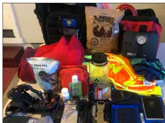
Getting a "Go Bag" ready is the best way to ensure that you are prepared for a sudden evacuation.