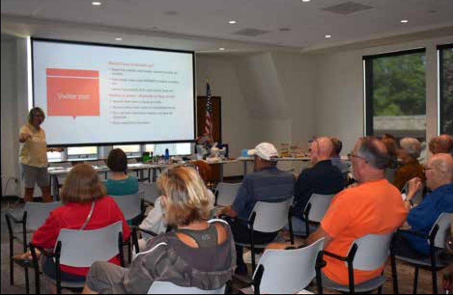
Preparedness training sessions at the Charbonneau Country Club keep that community's residents better prepared for emergencies.

Charbonneau's roster of MTRs run the gamut from