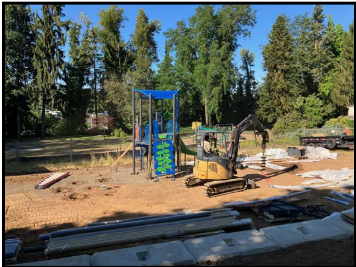
Ongoing construction of Boones Ferry Park Playground