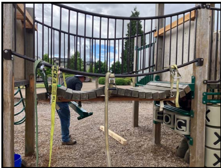
Team making playground repairs at Edelweiss