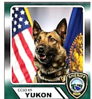
Meet YUKON The Sheriff’s Office ESD K9 Officer

If you’d like to see Yukon in action, check out this video: Yukon