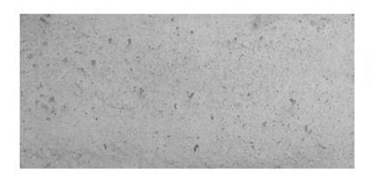
CAST-IN-PLACE CONCRETE WITH CLEAR SEALER