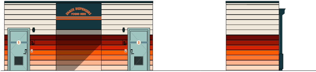
1 EXTERIOR ELEVATION (FRONT) SCALE: 1/8" = 1'-0"