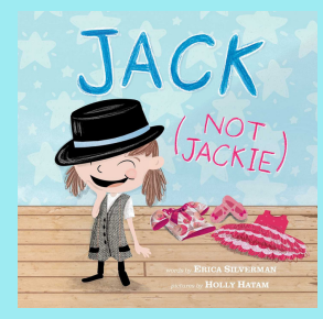
Jack (Not Jackie)

This visually rich picture book is an exploration of gender inclusion, useful pronouns, and kindness. It includes excellent reference material, for both children and adults, on starting conversations around gender, as well as nonbinary gender terminology.