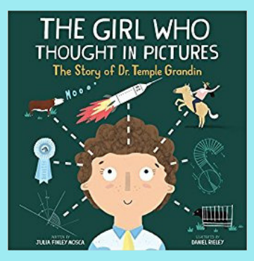
The Girl Who Thought in Pictures

A delightful read about being different than the rest of your family and still finding a place to belong.