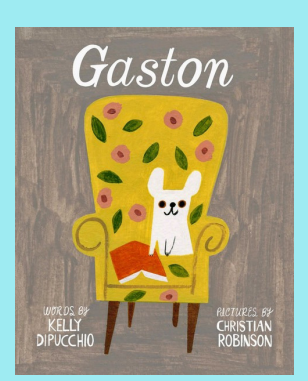
Gaston by Kelly DiPucchio

A delightful read about being different than the rest of your family and still finding a place to belong.