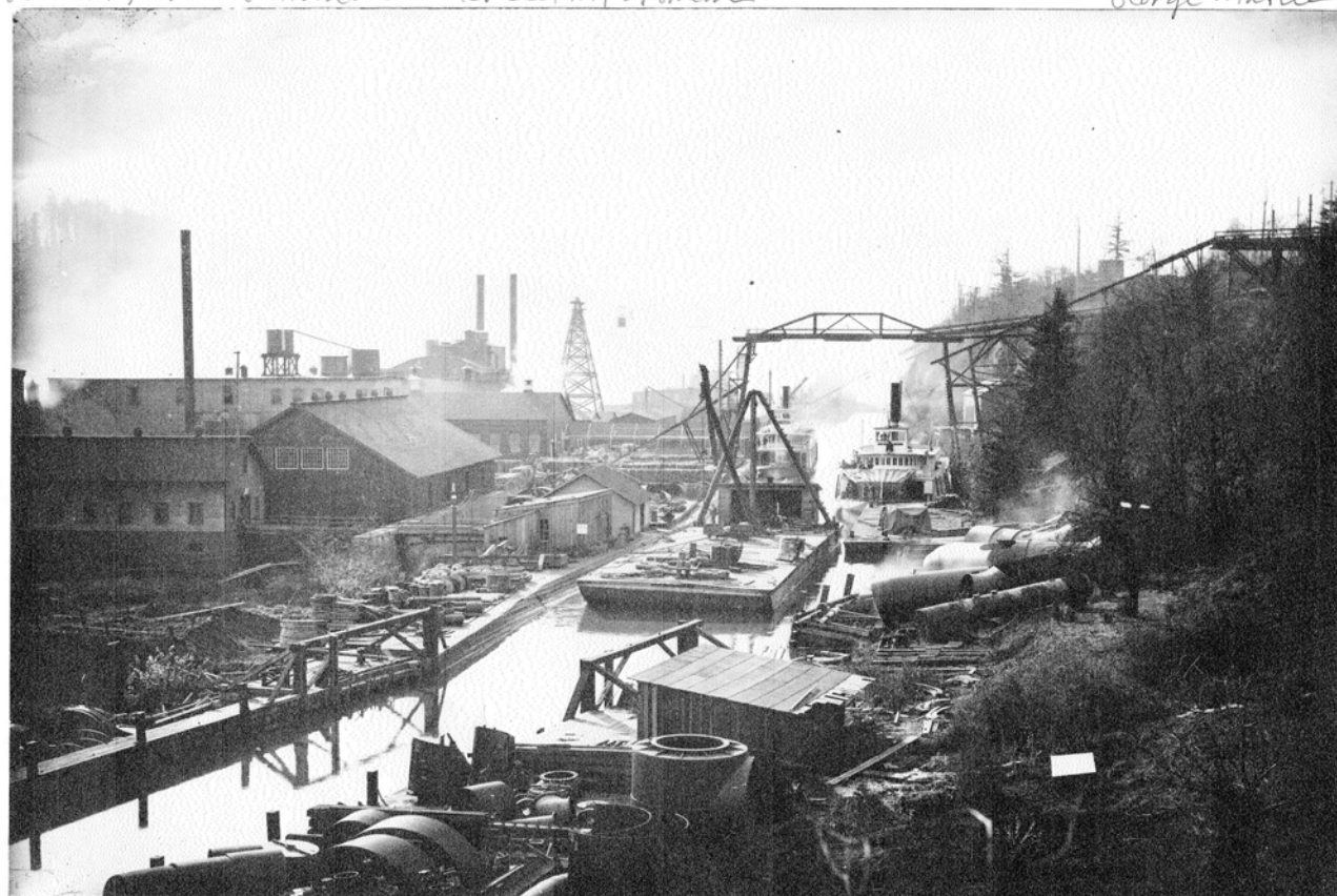
Willamette Locks, 1894.