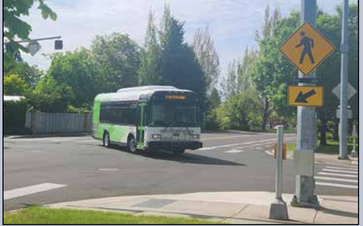
By utilizing SMART or other alternative transportation options to get to/from work, August 5-16, commuters can win prizes in Get There Oregon's "How Did You Get There?" Challenge.

To take part in the challenge, create a free account at bit.ly/SMARTchallenges . Log your trips by Aug.