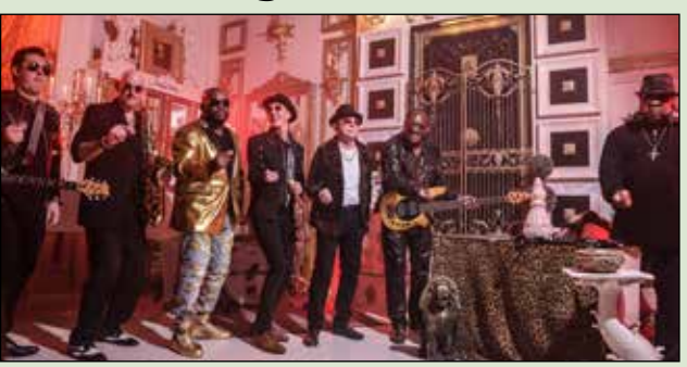
Hit Machine, a popular Portland-based cover band, headlines the final night of the 2024 Wilsonville Rotary Concert Series.

For details, visit WilsonvilleConcerts.com.