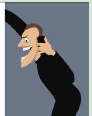
Using artificial intelligence, scammers can replicate the voice of a loved one to convince a relative to send money.

These are just a few recent examples. There isn't enough space to detail every trick employed by scammers. So make fraud awareness a regular topic of conversation, especially with older adults who are most often targeted by scammers.